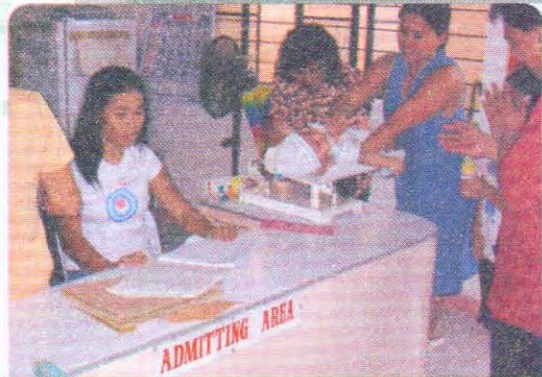
Primary Health Care training to provide basic health services.