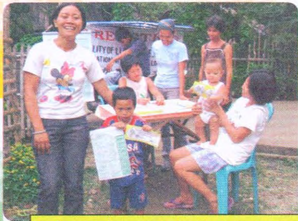
Birth registration project- the right to have a name and nationality.