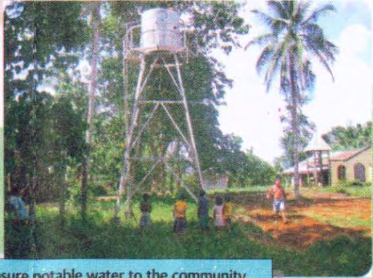
Water tank to ensure potable water to the community.