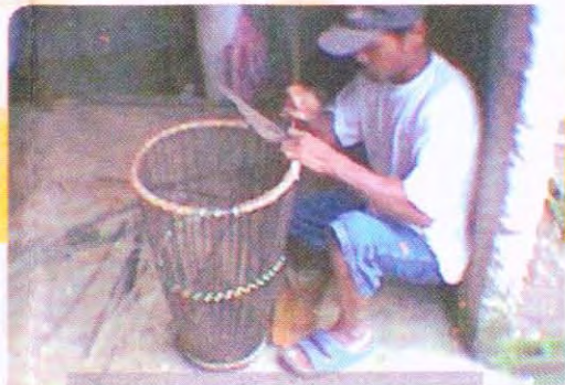
Handicrafts making made from indigenous materials for livelihood.